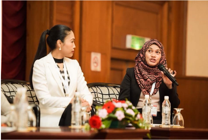
Photo Gallery AAED Plenary and Breakout Sessions-Penang Malaysia